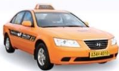
Regular taxi (Basic Fare: 3,000 won)