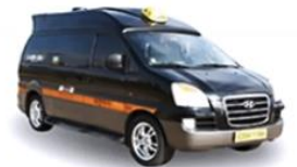
Van (Limousine taxi) (Basic Fare: 5,000 won)