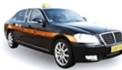
Luxury taxi (Basic Fare: 5,000 won)